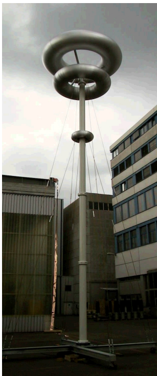
CR 4000-360 divider